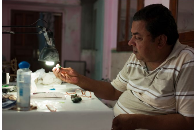
Figure 4. Examining the rough.

his pencil and murmurs some instructions to the preshaper. The preshaper pinches the stone between his thumb and forefinger, touches it to the abrasive wheel on his bench grinder and guides it into the shape that it is to take. It still doesn't look like much when he is finished with it. The shine and sparkle will only show themselves once it has been faceted and polished. But faceting and polishing are easy. They can be done by inexperienced apprentices in the Pahar Ganj where Muslim workers trade and manufacture stones. Sawing and preshaping are the essential processes that Mr Lunia must oversee himself. He must also be present for the sorting or his profits will line the pockets of his workers.